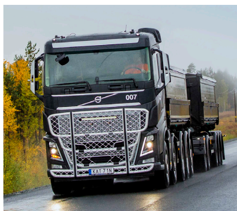
Major investment in safer roads.